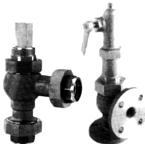
Union End Without Lift Lever Air Service Only 505100